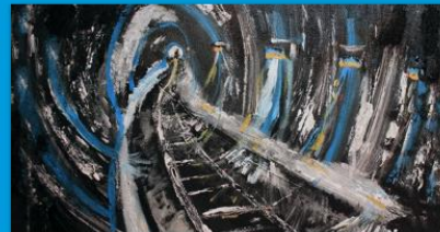
ROCK, MINING AND TUNNELLING