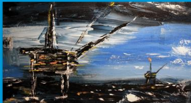
OIL, GAS AND OFFSHORE ENERGY