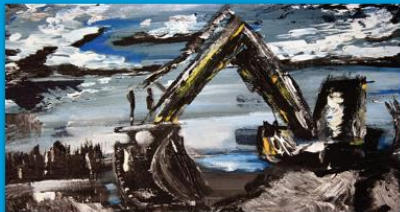
EMBANKMENTS, FOUNDATIONS AND EXCAVATIONS

essential for geotechnical professionals